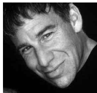
Stephen Schwartz, DCINY Composer-in-Residence